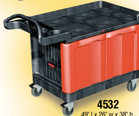
4532 49" l x 26" w x 38" h