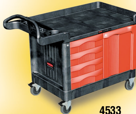
4533 49" l x 26" w x 38" h