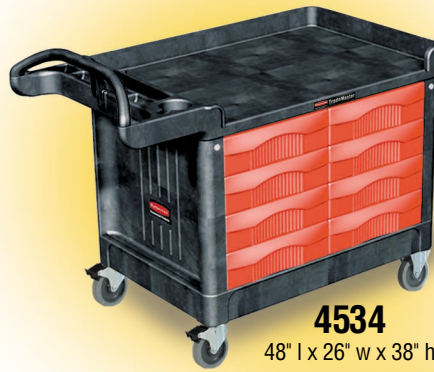
4534 48" l x 26" w x 38" h