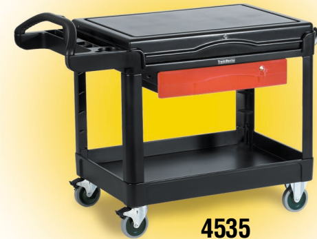
4535 53" l x 26" w x 38" h