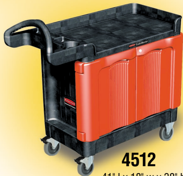
4512 41" l x 18" w x 38" h