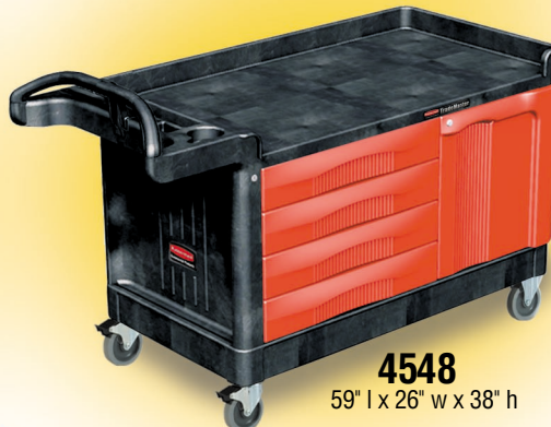
4548 59" l x 26" w x 38" h