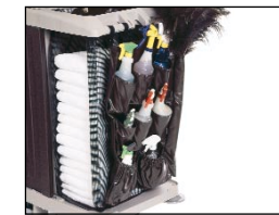
Nine-Pocket Caddy Bag Provides storage and organization for cleaning supplies.