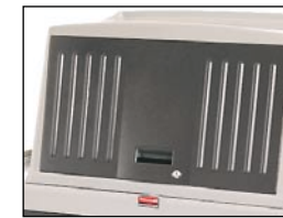
Locking Protective Hood Shields and secures top shelf contents from weather and theft.