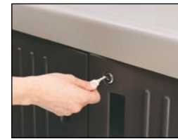
Locking Doors Provide security and hide contents. Doors open 270° and snap against sides of cart.