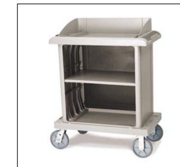
The Restock & Service Cart performs multiple duties: turndown cart, extra linen cart, self-serve food kiosk, mobile beverage service or mini-bar re-stocking cart.