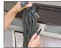
Vacuum Restraint Holds vacuum securely when storing and transporting.