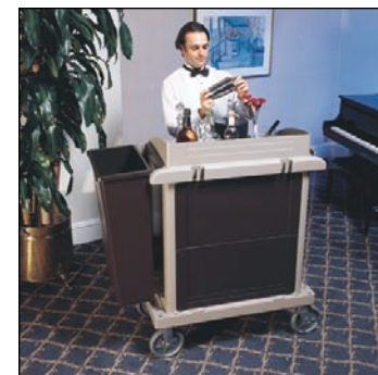
6198 Restock and Service

Right: The X-tra™ Restock and Service Cart is sized for smaller properties or for use as a stocking or turndown cart. It can stand alone as a self-serve kiosk or full-service mobile beverage cart. Add locking hood and doors for security.