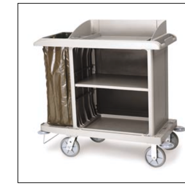
Compact model requires less floor space, holds more supplies, and maneuvers easily in tight spaces.