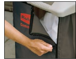
Canvas Bag Machine washable, holds large loads of soiled linens; zippered side opening.