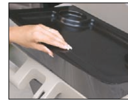
Refuse Cover Conceals unsightly trash or soiled linens.