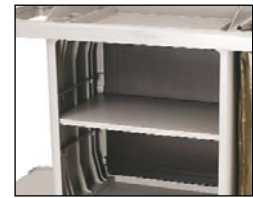
Adjustable Shelf Easily moves to allow compartment space as needed.