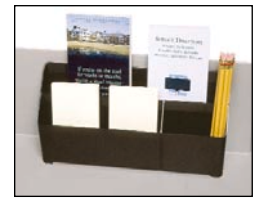
Brochure Caddy Conveniently organizes brochures, menus, note pads, and more.