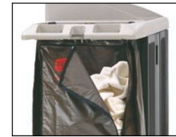
Vinyl Bag Expands as load increases; zippered side opening facilitates unloading.