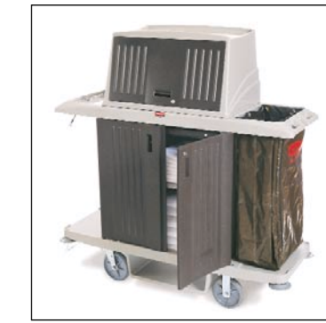
Full Size Cart with Protective Security Hood shields supplies, linens and personal items stored on the top deck from weather elements and damage.