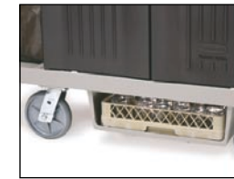
Under Deck Shelf Provides additional storage for glass racks, amenities, or cleaning supplies.