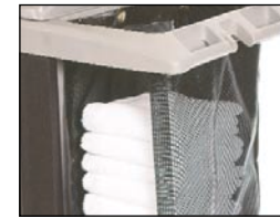
Linen Accessory Mesh Bag Expands to provide additional outboard storage for linens.