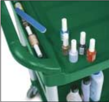
Essential for transporting supplies from station to station.