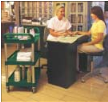
Carts provide a splash of color in trendy service environments.