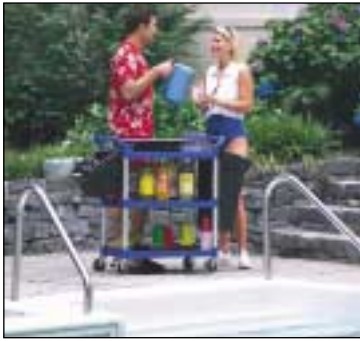
Ideal for serving food and drinks at special events.